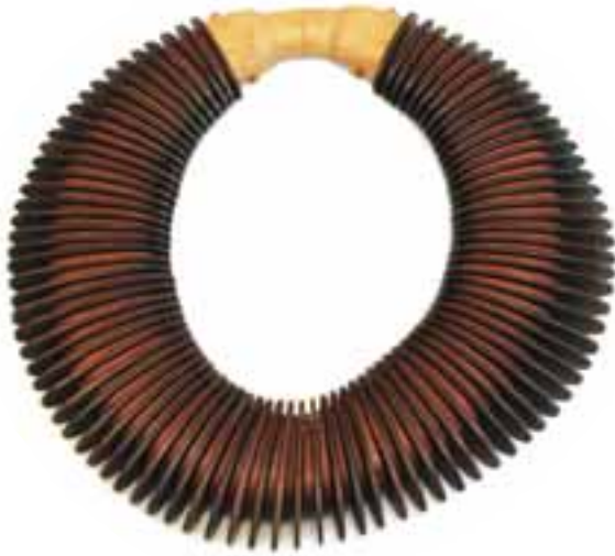
Norwegian Jewellery Exhibition