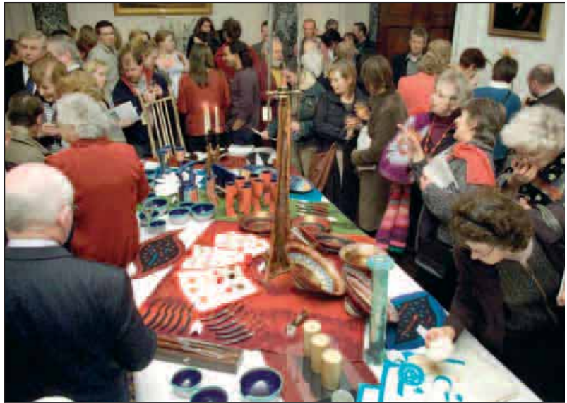
Crowds show up for the 'Feast' opening at Fota House, Cobh, Cork

The first exhibition of 'Feast' was held in June 2004 at the National Craft Gallery, Kilkenny and was supported by the Crafts Council of Ireland