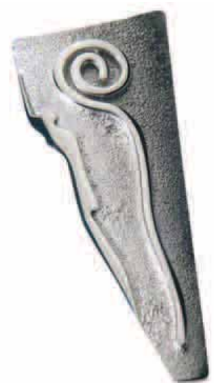
Product by Elaine Hanrahan

a unique service to the self employed individual. We act as a one stop shop for sole traders and small limited companies. Our services include the following: Vat returns, tax returns, bookkeeping, on going tax advice. We can deal with all general insurance enquiries: mortgages, pensions, investments, vivas health care and life assurance. Why not visit our website www.command.ie or T: 01 276 3630