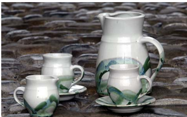
Pottery produced by students from the Pottery Skills Course

Are you crazy about ceramics? Have you ever been curious to see how a hand thrown bowl, or vase or plate is made? Or had the urge to have a go at the potter's wheel yourself? Well now is your chance – and it won't cost you a cent.