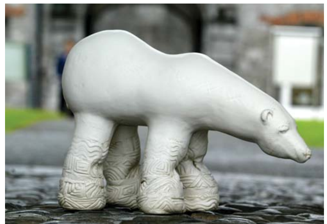
'Polar Bear' product of the Pottery Skills course

For further information contact: Cork Visitor & Convention Bureau @ t: 021 4815740 or einfo@cork4conferences.com