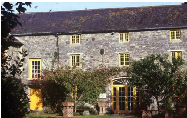
Pottery Skills Open Day at the Island Mill, Thomastown, Co. Kilkenny